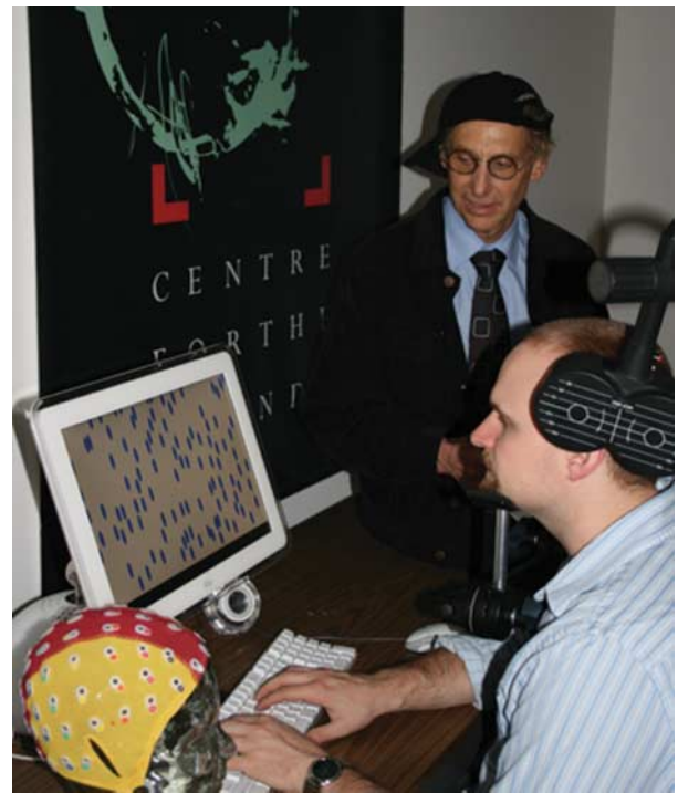
Figure 1. TMS set-up for the numerosity experiment.

We argue that the estimation of number by normal people is performed on information after it has been processed into meaningful patterns. The meaning we